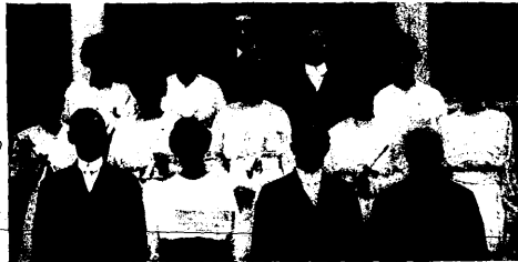
Postgraduates and Four Members of Faculty—Spring of 1919. Seven of These Students Are Now on Foreign Mission Fields.

Power of expression was always recognized by this master teacher as being vitally important for ministers of the Gospel. He encouraged the acquirement of Good English and unaffected oratory. His delight in the budding eloquence of each group of graduates was unbounded. He used to say that the human voice was the rarest of instruments at God's disposal when once its powers were fully realized and yielded to the Master. He also insisted upon a prominent place being given to consecrated music. He encouraged each individual who had a glimmering of talent to cultivate it thoroughly. Under his fostering care the chorus singing of the School has been developed into its present uplifting and inspiring ministry.