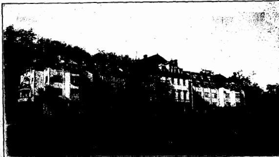
The Missionary Training Institute, Nyack, N. Y.

In this building hundreds of young men and women have received instruction in the Word of God, and learned to know Christ Jesus in intimate fellowship, and have gone out from the School to do effective service for God in the harvest fields of